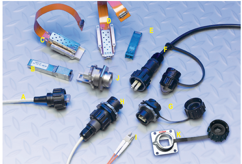
Left to right: A = Optical Industrial Ethernet Cable, B = Electrical RJ-45 to SFP Transceiver, C = Electrical Sealed SFP Module, D = Optical Sealed SFP Module, E = Optical SFP Transceiver, F = Industrial LC Cable Assembly with Cable Assembly Dust Cap, G = Industrial LC Adapter, H = In-Line Industrial LC Adapter Mated to an Industrial LC Cable Assembly, I = Duplex LC Cable Assembly, J = Sealed SFP Receptacle for Integrated Platforms C and D, K = Simplified SFP Receptacle

Molex also offers a Simplified SFP Receptacle, which allows end users to design their own board layout and transceiver options. The actual transceiver cage is positioned directly into the rear of the receptacle by the customer in accordance with the optical plane and front-end connectivity guidance provided by Molex.