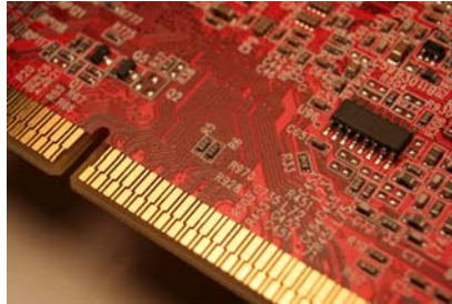
PCBs in industrial/telecommunication equipments